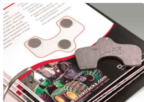
User Guide - sample section page