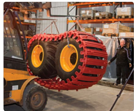
4 tonne factory photoshoot