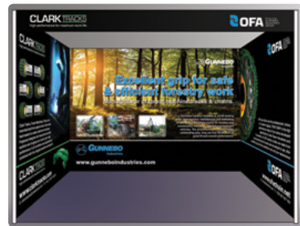
Shell Scheme for Trade Exhibition