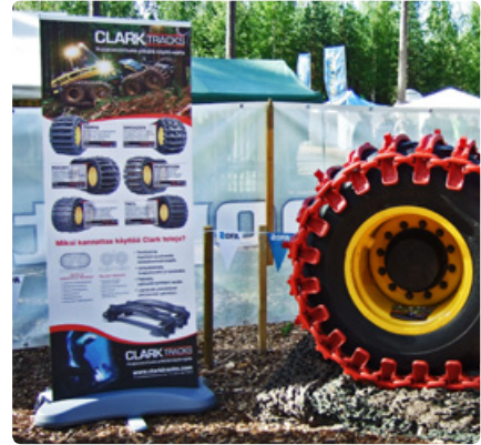
NEW Outdoor Exhibition Roller Banner

If you'd like to get your company's image back on track, or simply take it to difficult-to-reach places, we'd be delighted to help you.