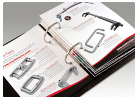
User Guide - inner information page