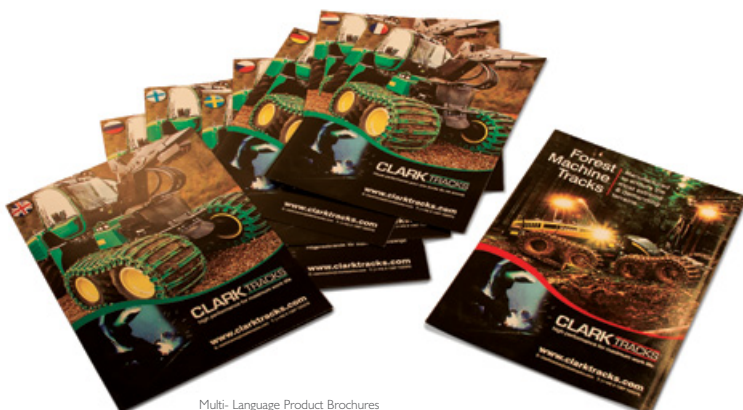
Multi- Language Product Brochures